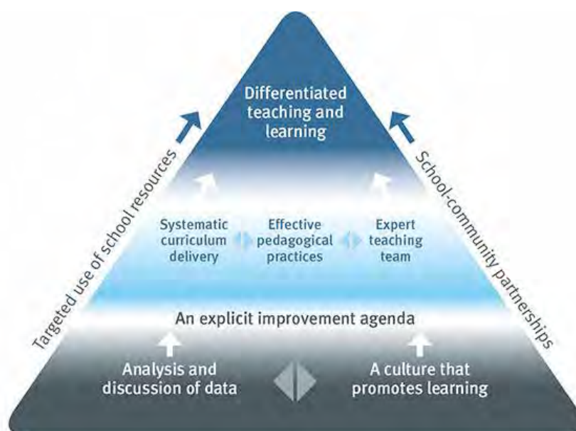
The School Improvement Hierarchy

The Parent and Community Engagement Framework for Queensland state schools uses current evidence and best practice to provide a model that supports schools to enhance parent and community engagement.